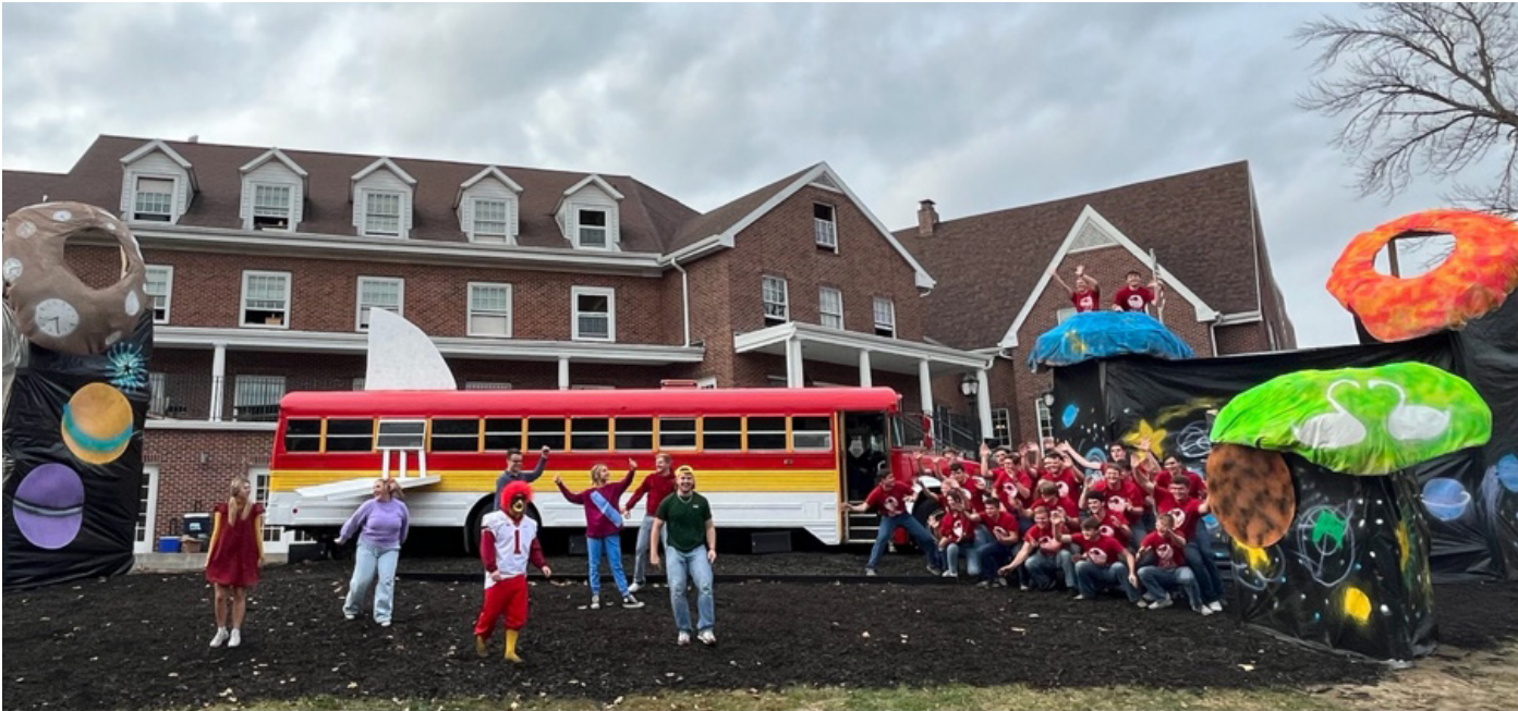
Lawn Display "The Magic CyRide"