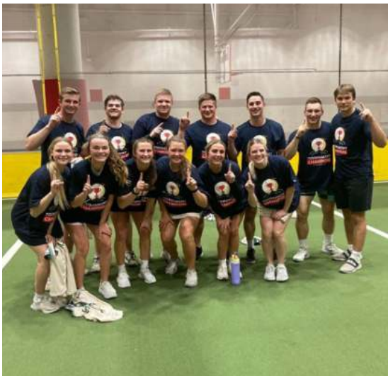
1 st Place Treds Team