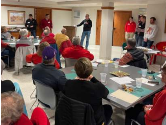
AGR Homecoming Ceremony