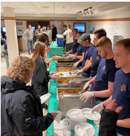
“Agger Fries” Philanthropy