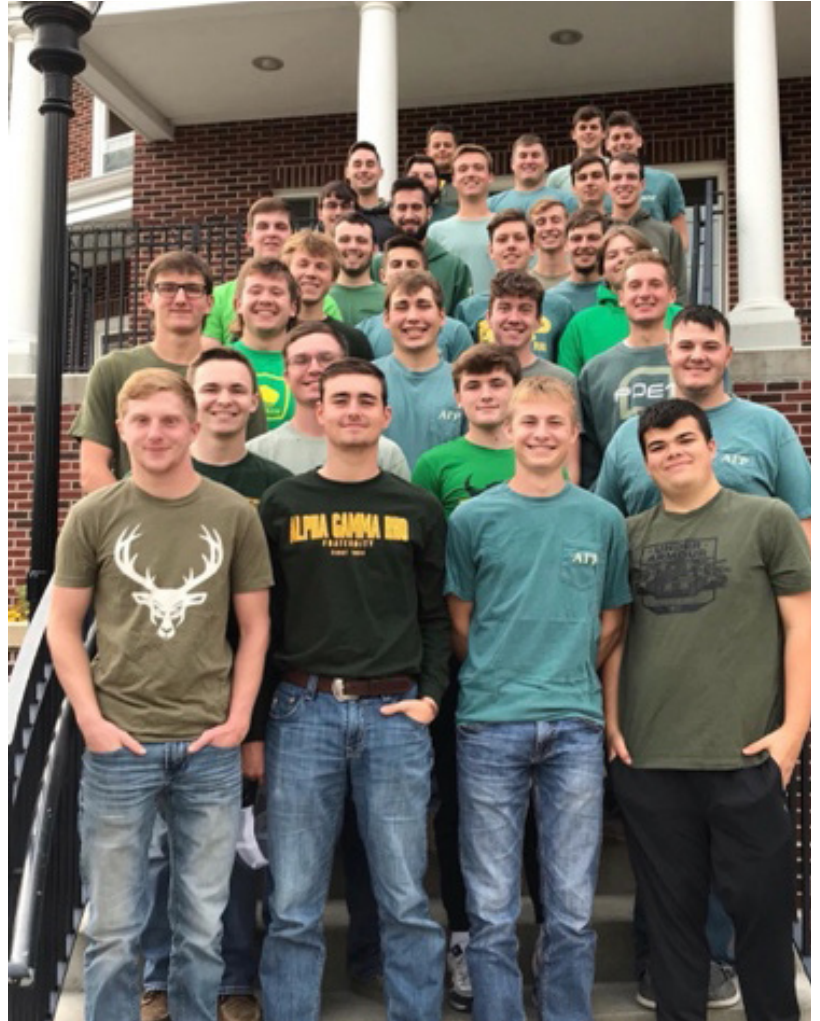
AGR Men Wear green in support of Sexual Assault Awareness