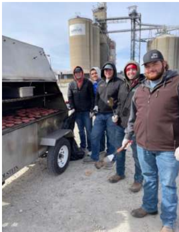
"Agger Helping Farmers" Philanthropy