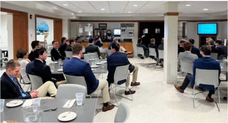
"Green Dot" speaker discussing sexual assault prevention with chapter