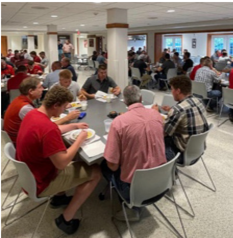
AGR Dad's Weekend